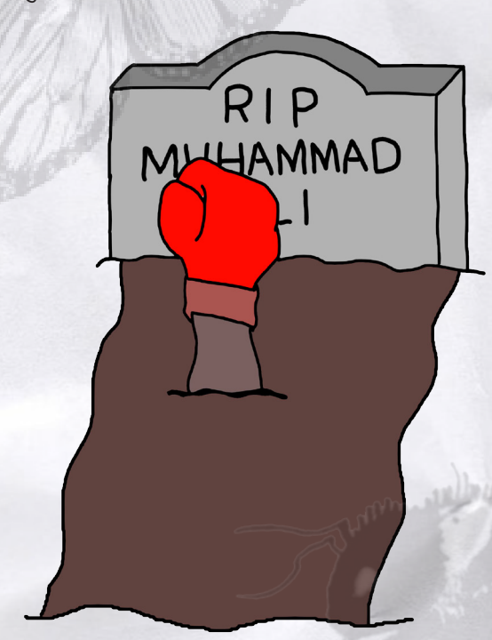
"Float like a BUTTERFLY, sting like a BEE."

(January 17, 1942 - June 3, 2016) Boxing record: 56 wins, 5 losses, 37 knockouts